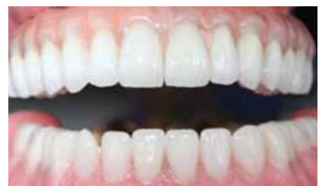
Fig. 12 Delivery of final prosthesis