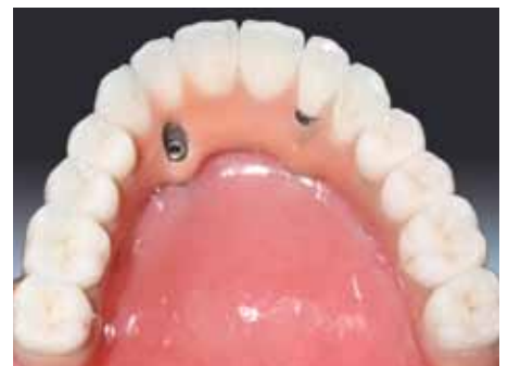
Fig. 11 Seal the screw access openings and cement the remaining crowns into place