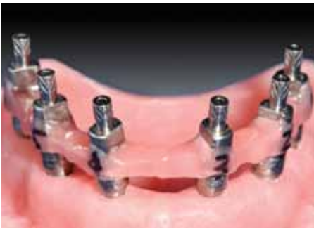
Fig. 5 Implant verification jig sections luted together