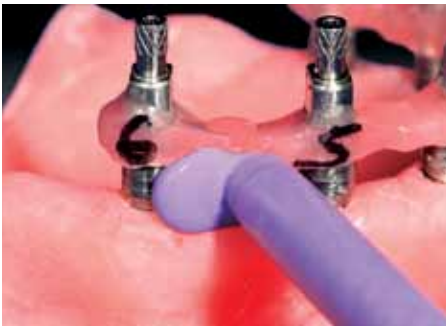
Fig. 6 Inject impression material under the jig