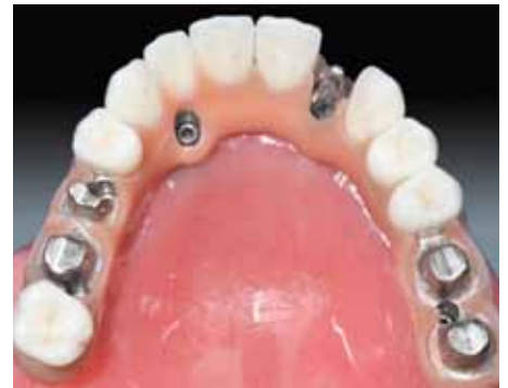
Fig. 10 Tighten abutment screws