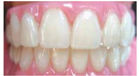
Fig. 8 Trial denture try-in