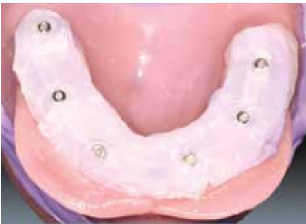
Fig. 7 Take an open-tray impression

rims, if necessary, so they meet evenly.