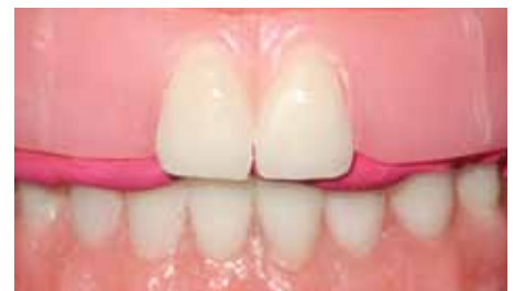
Fig. 3 Use bite registration material once occlusal dimensions are determined