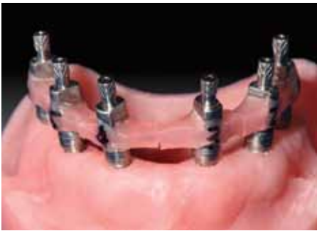
Fig. 4 Seat the sections of the implant verification jig and tighten the guide pins