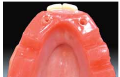
Fig. 2 Seat screw-retained bite block