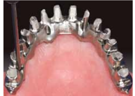
Fig. 9 Framework on patient model