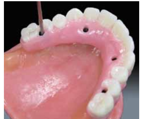
Fig. 11 Framework try-in