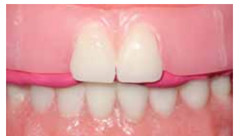
Fig. 3 & 4 Seat Screw-Retained bite block. Use bite registration material once occlusal dimensions are determined.