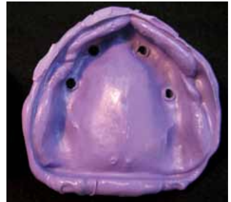
Fig. 1 & 2 Preliminary implant level impression