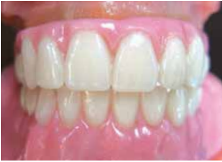
Fig. 5 Trial denture try-in