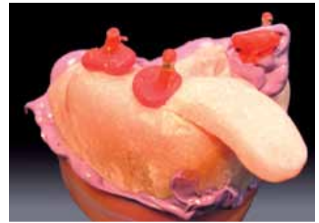
Fig. 10 Take an open-tray impression