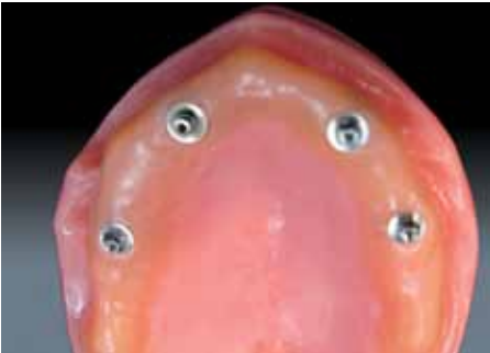
Fig. 6 Abutments on implants