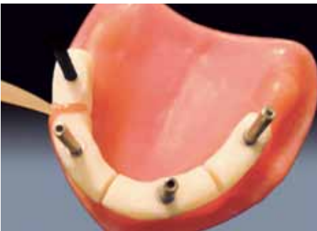
Fig. 7 Luting sections of the implant verification jig