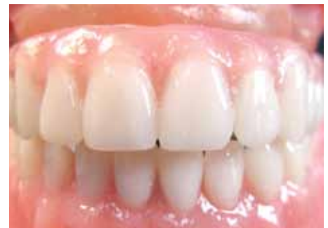
Fig. 12 Delivery of final prosthesis