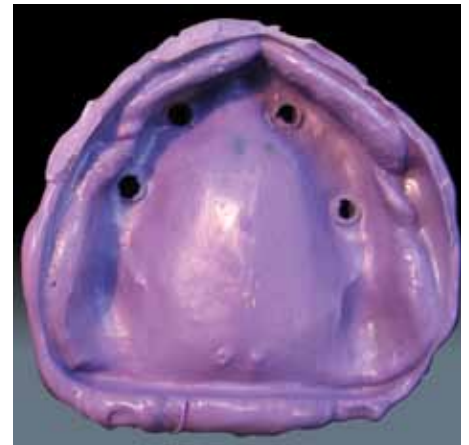
Fig. 1 & 2 Preliminary implant level impression