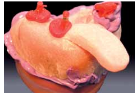
Fig. 9 Take an open-tray impression