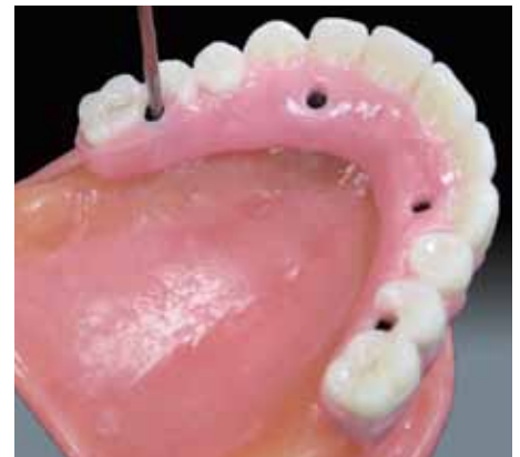
Fig. 10 Framework try-in