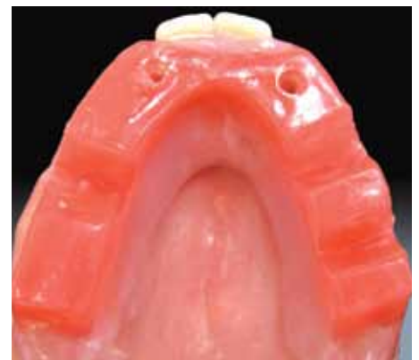
Fig. 3 Seat screw-retained block