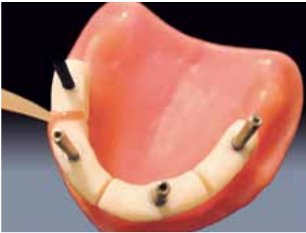
Fig. 6 Luting sections of the implant verification jig