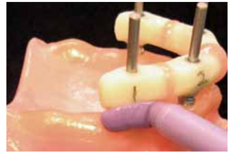
Fig. 8 Inject impression material under jig