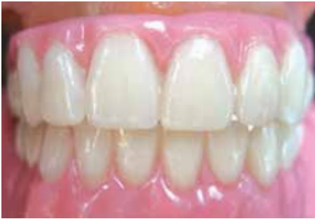
Fig. 5 Trial denture try-in