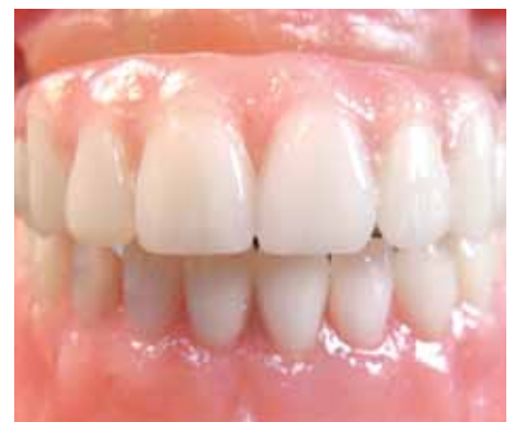
Fig. 11 Delivery of final prosthesis