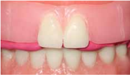
Fig. 4 Use bite registration material once occlusal dimensions are determined