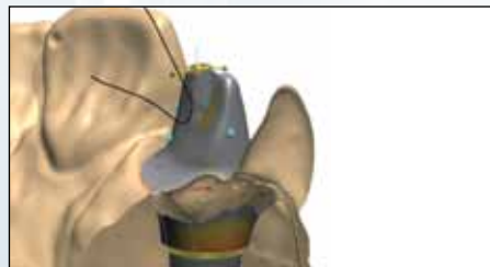
The new generation of AbutmentDesigner allows for faster customized abutments. $5,000 additional cost with 3Shape System purchase. $99/custom titanium abutment with design file.