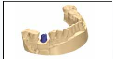
Scan of wax-up abutments and wax-up implant bridges for copy milling. The scan can be further modified (e.g., overall reduction or using Sculpt Toolkit).