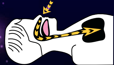
Normal jaw position, airway open.