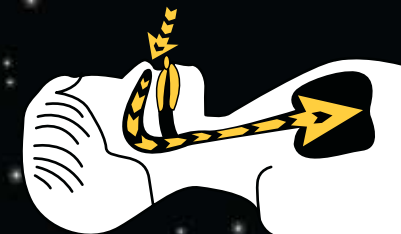
TAP® maintains forward jaw position and keeps the AIRWAY OPEN!!!